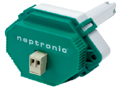
Duct Temperature Sensor