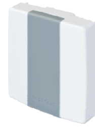
Room Temperature Sensor