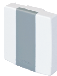
Sonde de pièce