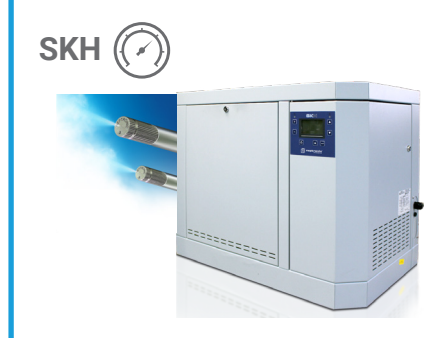
High Pressure Atomizer